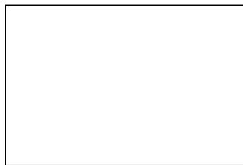
draw pictures on bottom sheet